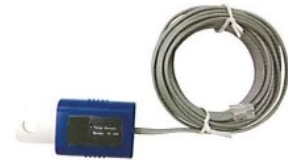
TF-100 Temperature Sensor