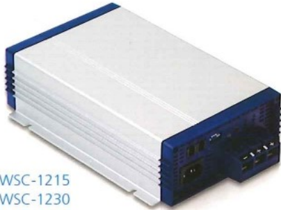
WSC-1215 WSC-1230 WSC-2415