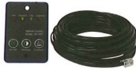
RC-600 Remote Control